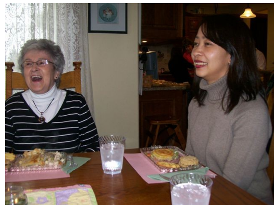
Ladies enjoying the Scottish Chicken & Mushroom pie at the Progressive Dinner

2 c all purpose flour ¼ t salt ½ c cold butter diced 1/3 c Crisco diced 8 T chilled water